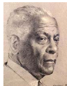
Dr. Benjamin E. Mays (1894–1984)